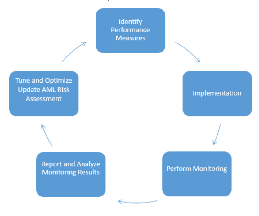
Overview of Performance Monitoring Framework

OCC 11-12 states that ongoing monitoring begins when a model is implemented in production for business use. As shown in the diagram below, monitoring should provide continuous feedback about the AML model that can be used to update the model as needed.